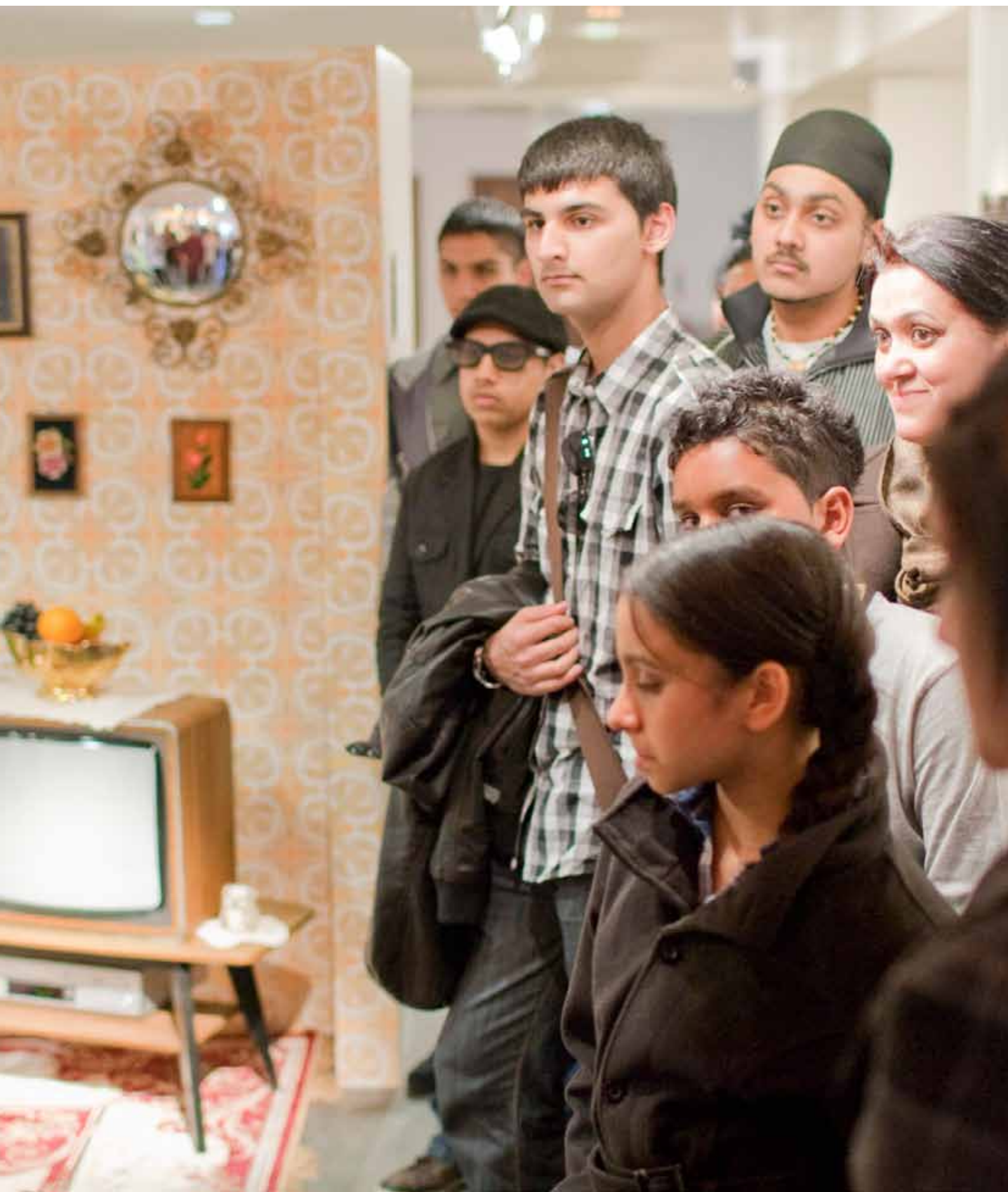
Below: Bangra Bonanza group looking around the Southall Story exhibition at the Southbank Centre