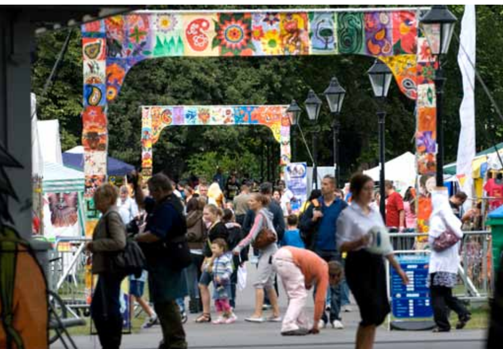
Above: The Mela Archways