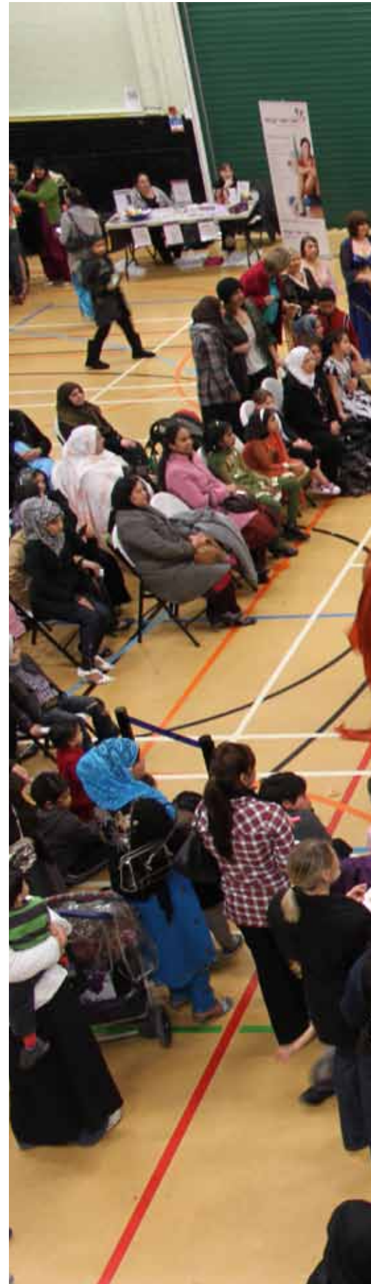
Right: International Women's Evening