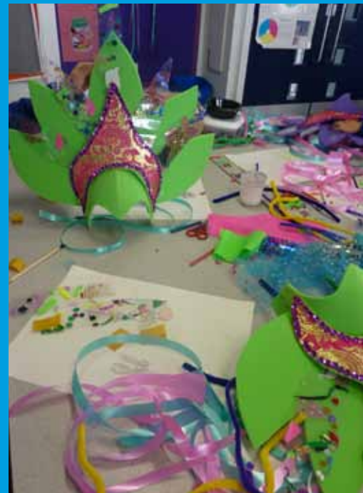
Above: Carnival headdresses made at the Bollywood Baraat teacher training course