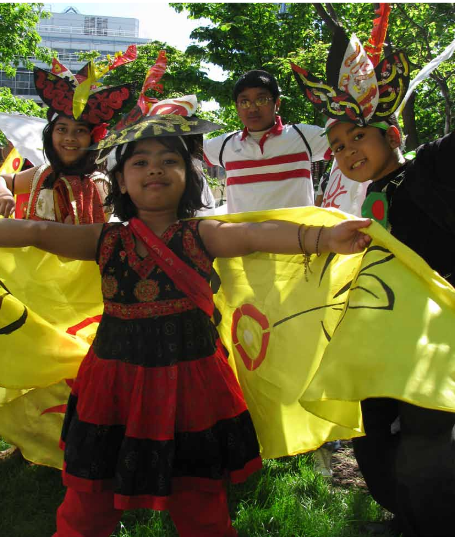
Children from the Bangla music project showing off their costumes that they made for the London Baishaki Mela