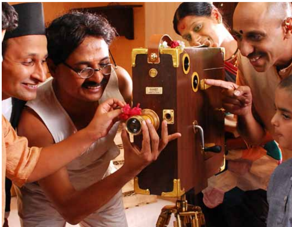
Above: Harishchandrachi Factory UK premiere