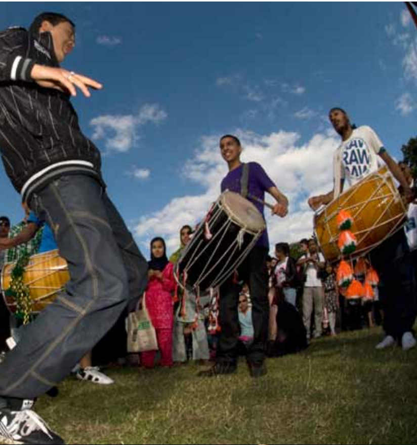
Below: Karparty Polish dancers on the new 2nd Stage at Southampton Mela Festival 2010