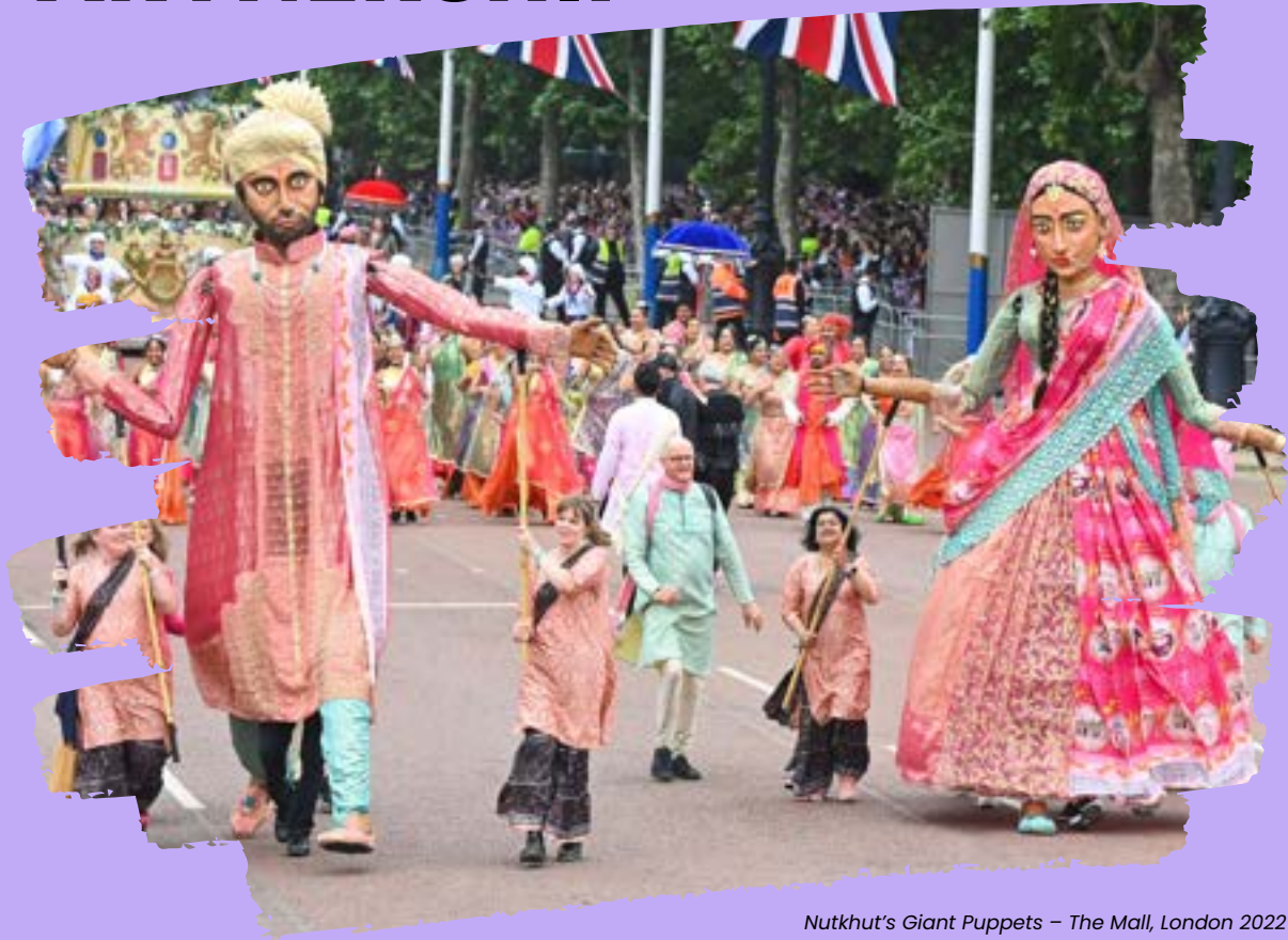
Nutkhut's Giant Puppets – The Mall, London 2022

Working in partnership with Nutkhut and the Mela Partnership we welcomed Nutkhut's Bride and Groom to Southampton Mela 2022. These two giant puppets stand 4-metres-tall and were featured as part of the Platinum Jubilee Pageant celebrations in Central London.